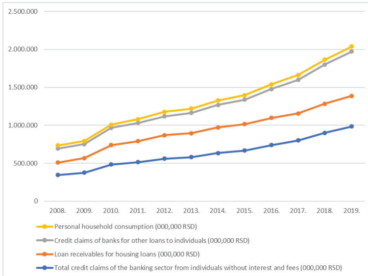
Chart 1 The curve of individual consumption of households and the curve of credit claims of banks from natural persons in Serbia in the period 2008-19. in millions of RSD